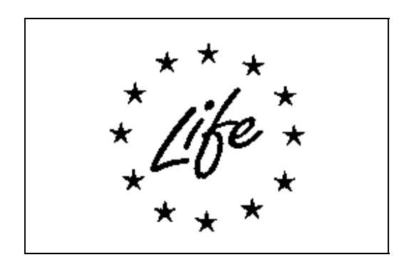
LIFE Project Number